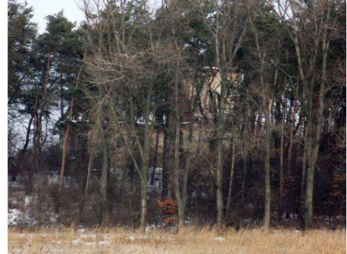
Fig. 4. The ruins of the old Protestant church in Piaski

Today, dense vegetation and overgrowth does not allow for proper appreciation of the complex architectural value that the former Protestant church in Piaski undoubtedly still retains. Left unattended, it has been deprived of its roof, window frames and some of the plasterwork. There are also only traces left of its surrounding walls, which are difficult to find in the dense vegetation on Kościelec Hill. However, Piaski's municipal authorities have undertaken the revitalization of this element of their city's history with a planned investment that aims to renew and adapt the old church to a new function [8]. As part of a workshop entitled Planning for Real , a 1:200 scale model of the church and its surroundings has been built (Fig. 5), to be used as the centrepiece of discussion with local activists and residents of the area about its possible future uses.