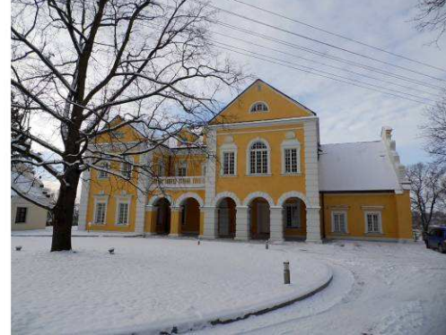
Fig. 3. Gardzienice Palace

The Centre adapted not only the former palace, but also the entire historical grounds around it, including the outlying buildings. All of this was made possible largely through EU funding and the involvement of the Centre itself. Gardzienice can be proud of the place, visited by guests from Poland as well as from all around the world.