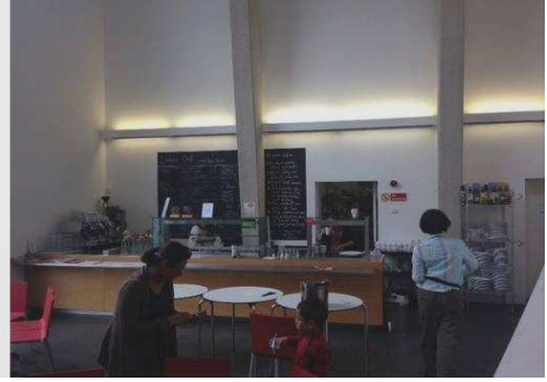
Fig. 1. The Lumen United Reformed Church & Community Centre URC in London

Here in Poland, a hint of this kind of adaptation can be seen in the Alfa Shopping Center, at the intersection of A. Mickiewicz and Świętojańska streets in the northeastern city of Białystok. The conversion work done to the area and 19th century buildings of the old Becker factory now distinguishes this shopping centre from hundreds of others (Fig. 2), with historic elements of the former factory preserved and re-used in the new design. This combination of historic buildings with modern materials, so often encountered in many newly-adapted shopping centres, tends to be interesting and successful. The Alfa is an example of respect for an existing, historic structure that forms part of the character of the city.