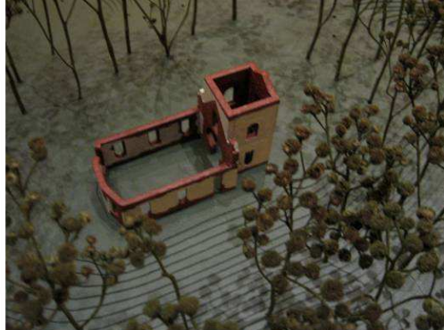
Fig. 5. A model of the ruins of the Protestant church and its surroundings in Piaski (photo: 'MODEL IN SCALE' by Piotr Jezierski)